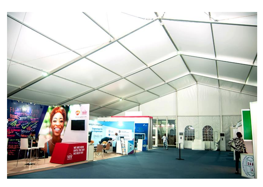
ICASA 2019 In-person Exhibition Hall