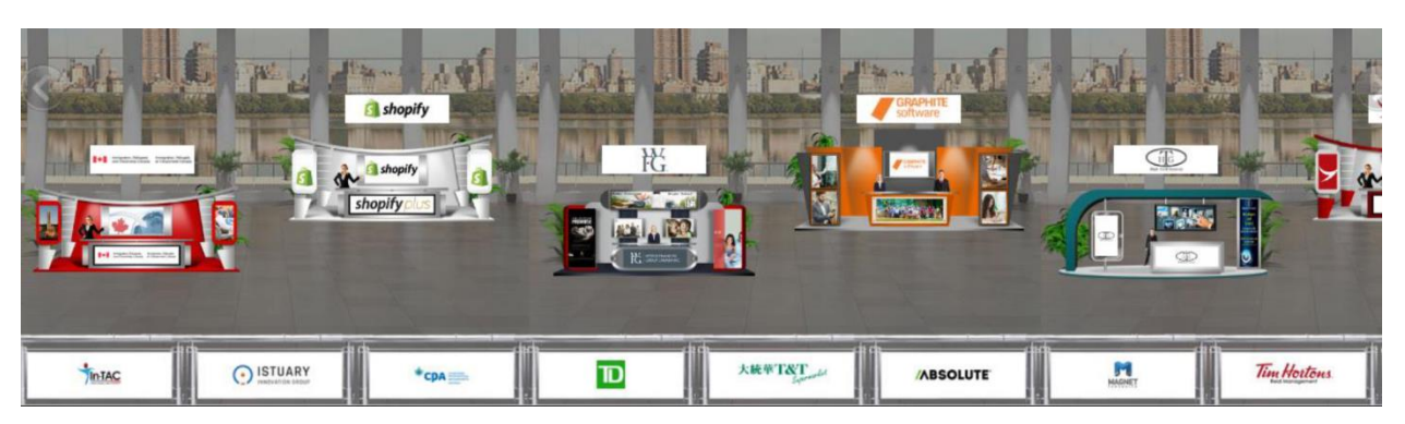
Virtual Exhibition Hall