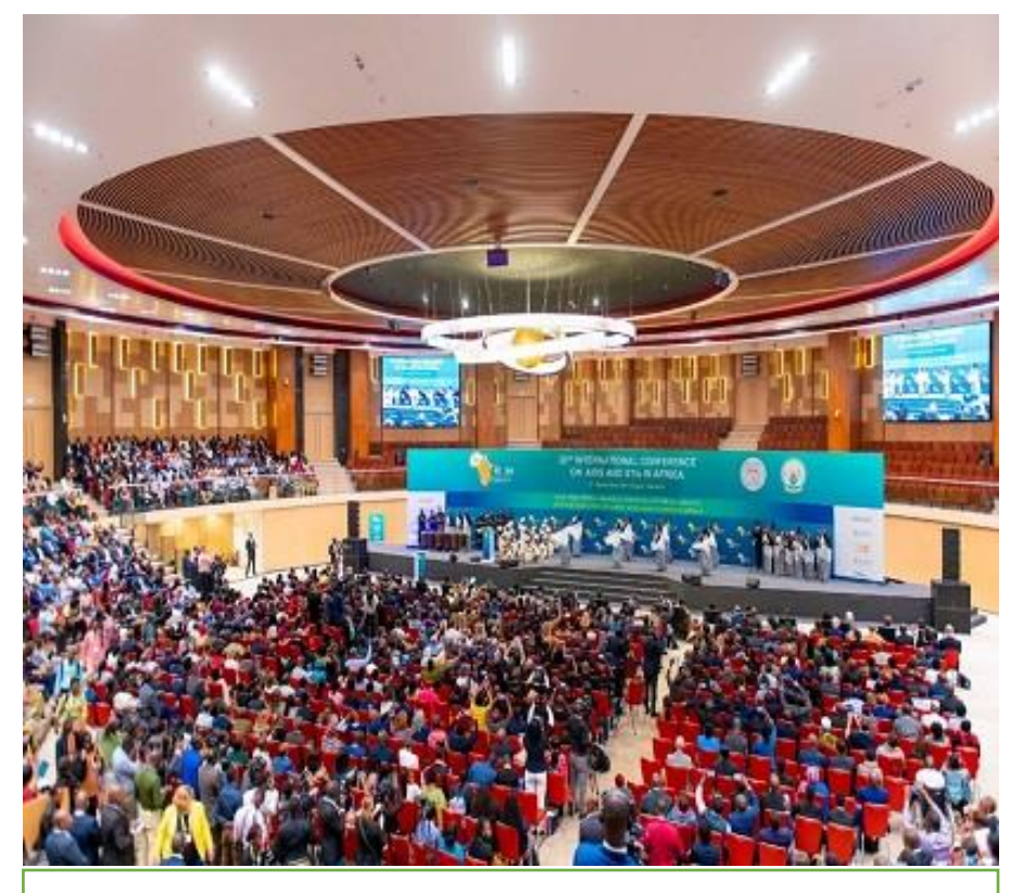
ICASA 2019 OPENING CEREMONY

Please see following pages for details on each item.