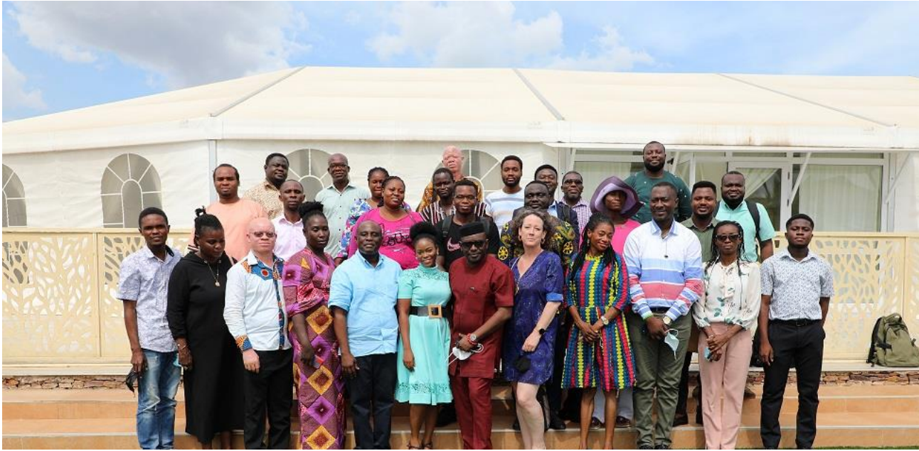
Group Photograph of Participants & Facilitators at the Full Circle Tax Watch Monitoring Project for Marginalized Populations Research Workshop